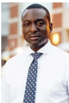
Keynote speaker: Dr. Yusef Salaam of the Exonerated Five

Saturday, Jan. 11, 2020 8:30 a.m. to 1 p.m. THOMPSON STUDENT UNION AUDITORIUM