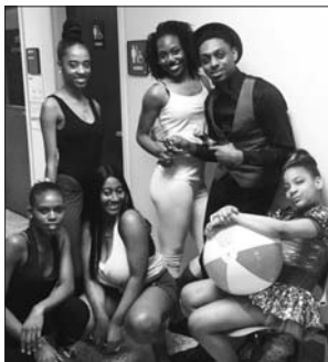
Models posing for yoga scene