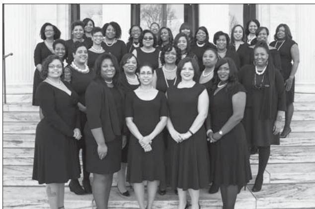
Jack and Jill Current Members

Our children are our most precious gifts. The Toledo Chapter of Jack and Jill, Incorporated is proud to celebrate 65 phenomenal years of Teaching, Leading, Impacting, with our children and for our community.