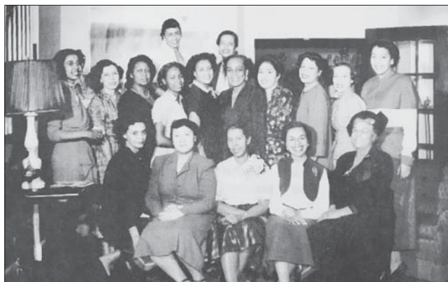
Jack and Jill Original Chapter

Take the next step to homeownership with our Community Home Loan