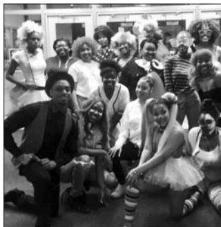
Cirque Du Solslay finale