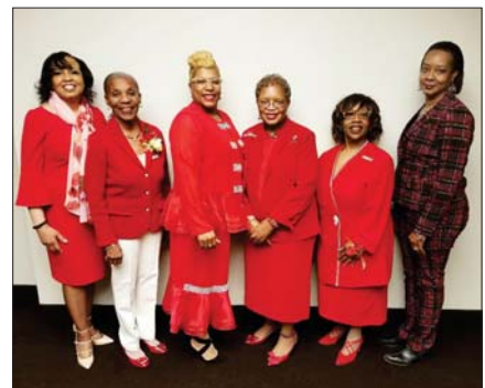
NANBPWC Toledo Club Members