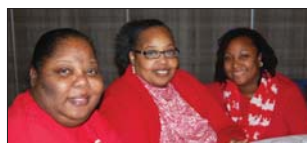
members of Delta Sigma Theta Sorority Inc..