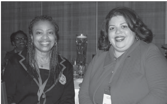
visiting members of Delta Sigma Theta Sorority Inc.