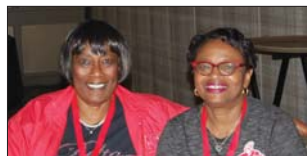
Opening event attendees, of Delta Sigma Theta Sorority Inc.