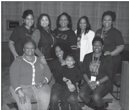
Toledo Alumnae members of Delta Sigma Theta Sorority Inc.