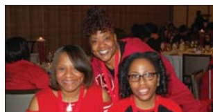
Ohio Statewide opening event attendees, members of Delta Sigma Theta Sorority Inc.