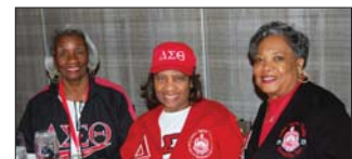
Ohio Statewide attendees of Delta Sigma Theta Sorority Inc.