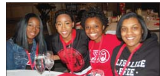
members of Delta Sigma Theta Sorority Inc...