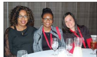
members of Delta Sigma Theta Sorority Inc.