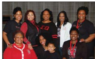
Delta Sigma Theta Sorority Inc. Toledo Alumnae Chapter