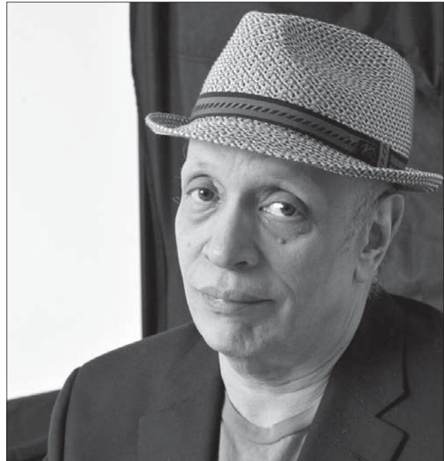
Walter Mosley

This is one of those books that leaves you a little breathless – not only while you're reading, but once the back cover's closed, too. For anyone who loves hard-bitten PI thrillers, reading Down the River Unto the Sea couldn't be more right.