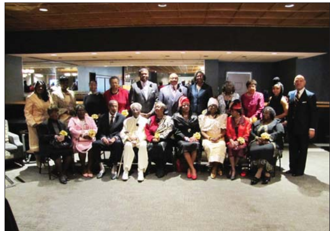
The Unsung Heroes