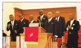
Men's Day choir