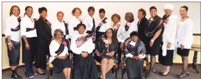
Founders' Day Committee