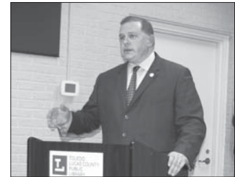
Mayor Wade Kapszukiewicz