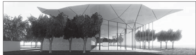
Sketch of new Mott Branch