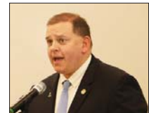
Mayor Wade Kapszukiewicz