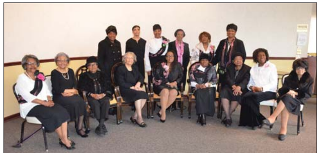
The Golden Sorors