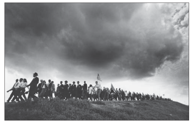
I Dream Photo