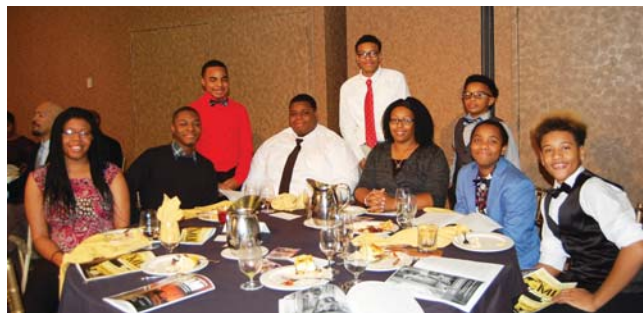
University of Toledo Upward Bound Program Students