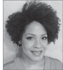
So You Want to Talk About Race Author, Ijeoma Oluo

Overall, this book will do exactly what its author sets out to do: it'll spark conversation and it'll make you think. So You Want to Talk about Race proves that black and white isn't always clear at all.