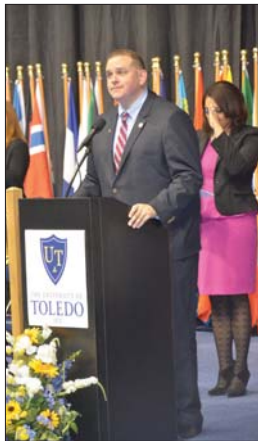
Mayor Wade Kapszukiewicz