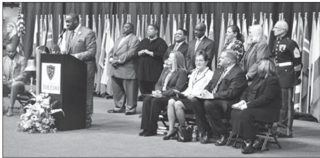
Speakers and Unity Committee