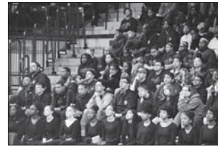
Toledo Public Schools Boys and Girls of Excellence