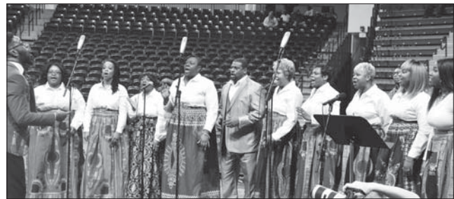
United Vision Choir