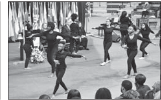
Toledo School for the Arts Dance Troupe