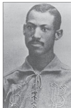
Moses Fleetwood Walker