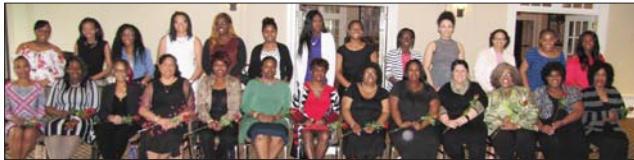
Debs and mothers