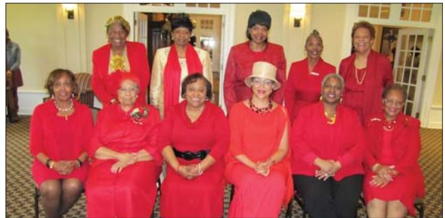
NANBPWC Officers and Cotillion Committee members