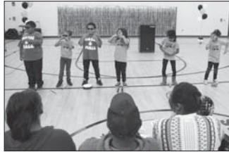
Second graders singing Superstition

"We look at where you can put philanthropic dollars that don't just put a band-aid on something, but actually make change occur in a positive way that brings those dreams and hopes that we all talk about into fruition, into actuality. And so for us, we look at the programs they do around education and workforce development, juvenile justice and education. They're working for results that show positive change, not just for the individual, which is the first critical piece, and not just a family, which is part of that critical