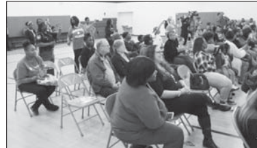
Family and friends enjoy the closing ceremony

piece, but for the entire community because it translates for each and every one of us."