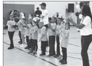
First graders singing Happy Birthday