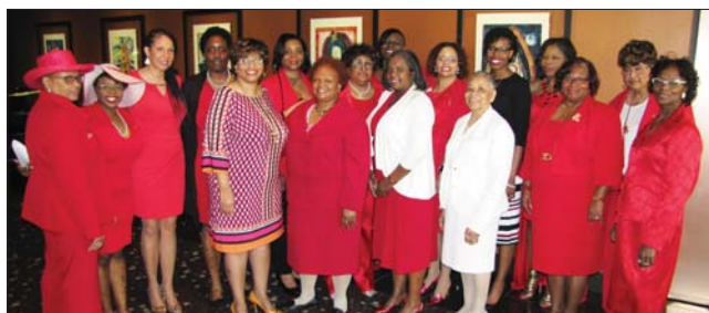
Delta officers and committee chairmen