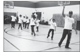
Third and fourth graders dancing to Pastime Paradise