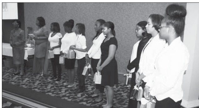
Presenting Delta Dears

Delta Breakfast... continued from page 12