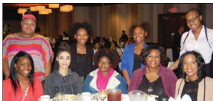
Bowsher High School