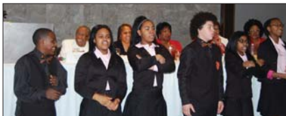
Old West End