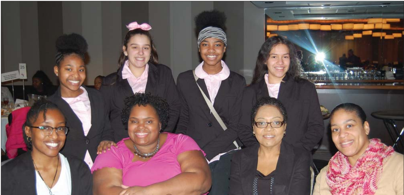
Students and Faculty of Sherman Elementary School