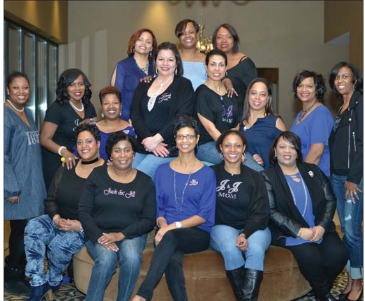
Members of Jack & Jill

Over the years, Jack and Jill has partnered with and served local organizations such as Boys and Girls Club of Toledo, Mom’s House, The United Way of Greater Toledo, March of Dimes, Toledo Lucas County Public Library, the Toledo Zoo, The Toledo Museum of Art, Mercy Health, Komen of Northwest Ohio, Food For Thought and more.