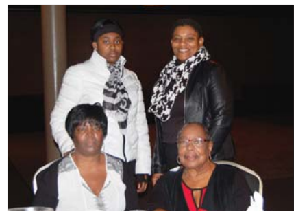
Scott High School boosters