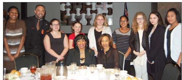
Navarre Elementary with Durant