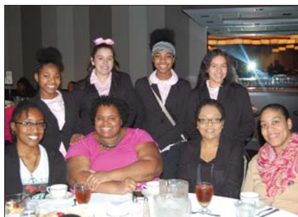
Sherman Elementary School