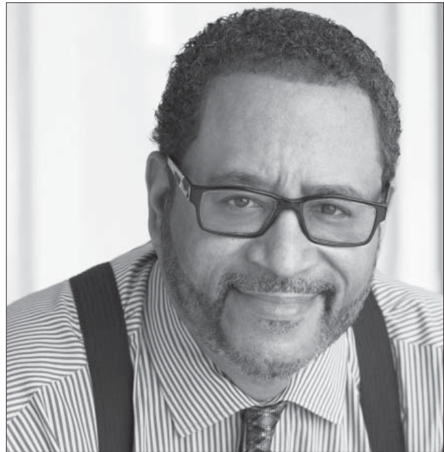
Michael Eric Dyson

c. 2017 St. Martin's Press $24.99 / $34.99 Canada 228 pages