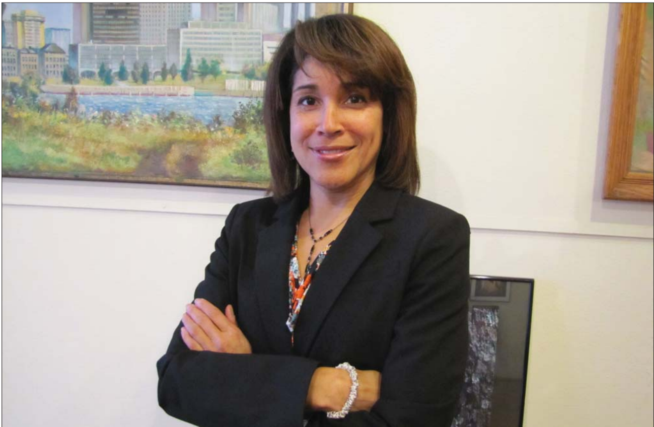
CEO, Connecting Kids to Meals