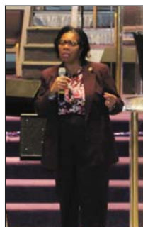
Mayor Paula Hicks-Hudson

There are nine values upheld by TUSA member congregations: the members of all segments of the community should be heard and valued; that people themselves have the power to determine their future and have a responsibility to speak up and demand justice for all; God is first and we seek divine guidance for all our actions, human beings are created in the image of God and therefore deserve to be treated with fairness, dignity, and respect; we value the diversity of our multi-lingual, multi-cultural communities; display the highest level of integrity in all of our activities and actions; and uphold moral and ethical standards in our congregations and in public life.