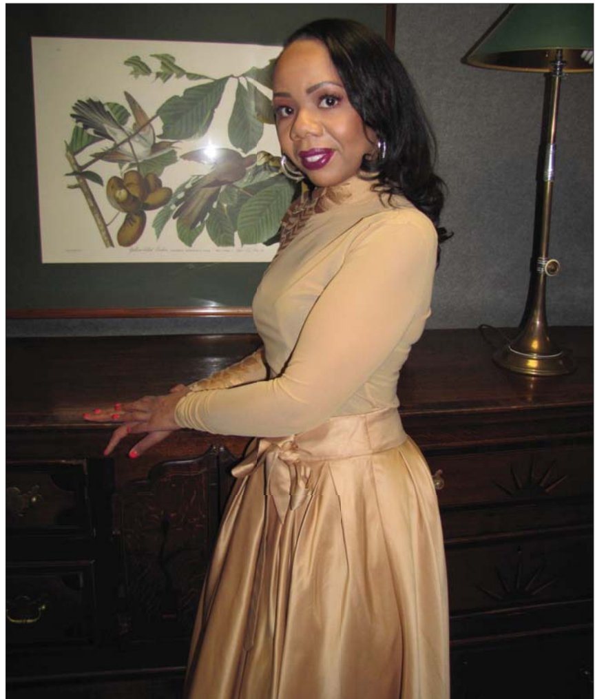
Helping Others Find Their Greatness - Page 5

"If you can wake up and feel that you have been just, responsible, reliable, and fair and are doing what God wants you to do, then you have a good chance at success."