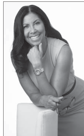
Believing in Magic Author

I could have used more like that half of the book, and less of the overly-told early years, but that's just me. Overall, I think Believing in Magic is at least worth a try; you've probably read better, you've probably read worse.