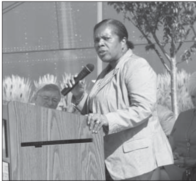
Mayor Paula Hicks-Hudson