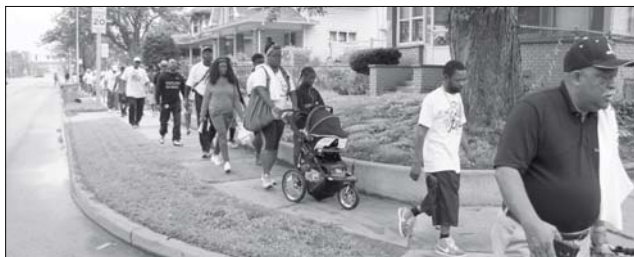
Fatherhood Walk 2015