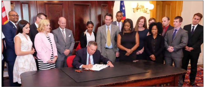
Gov. Kasich signs cosmetology bill into law