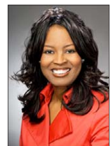
State Rep. Alicia Reece

The law will go into effect 90 days after the governor's signing.