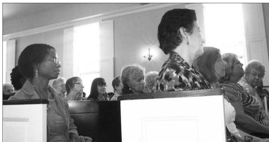
First Presbyterian and Search Lite congregations