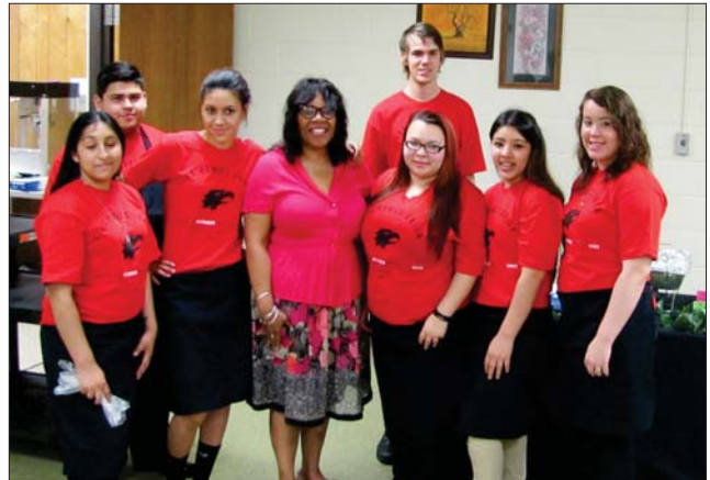
Hicks-Hudson and FLOC youth group