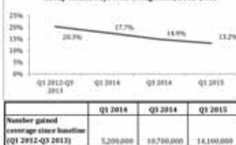
Quarterly estimates of the Uninsured Rate Gallup-Healthways Well-Being Index, 2012-2015

Source: Office of the Assistant Secretary for Planning and Evaluation (ASPE) analysis of Gallup-Healthways Well-Being Index survey data through 3/4/15. All models update the analysis from Summer of 2014. All models use nationally-representative survey weights and adjust for age, sex, race, ethnicity, employment, household income, state of residence, +/- a three time trend.