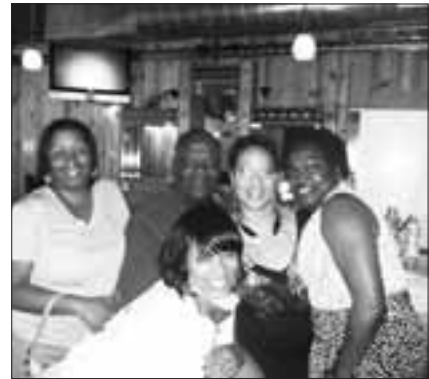
Staff and customers at The Peacock