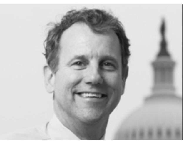
Sen. Sherrod Brown

The Sojourner's Truth, 1811 Adams Street, Toledo, OH 43604 Phone 419-243-0007 * Fax 419-255-7700 thetruth@thetruthtoledo.com www.thetruthtoledo.com