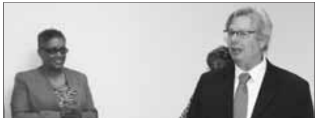
Commissioner Gerken addresses audience