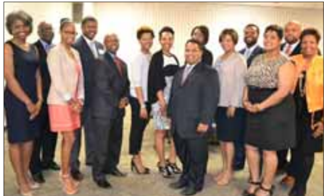
African Initiative of United Way leaders