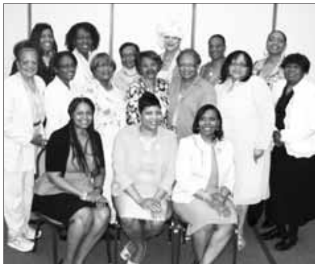
Alpha Kappa Alpha Sorority Inc., Zeta Alpha Omega Chapter Scholarship Committee