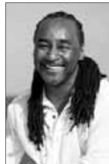
Eric Jerome Dickey

You should've already figured out that this isn't Beaver-Cleaver territory; A Wanted Woman is filled with bloodshed and profanity, but there's nothing iller than a thriller like this. If an action-packed book is what you need, grab it – and be prepared.