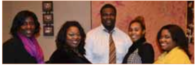
Musicians of In The Midst of It All