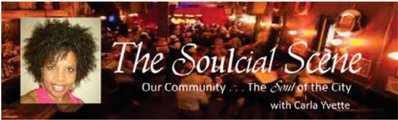
Toledo's Soucial Scene • Toledo's Soucial Scene • Toledo's Soucial Scene • Toledo's Soucial Scene • Toledo's Soucial Scene