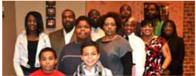
Cast of In The Midst of It All