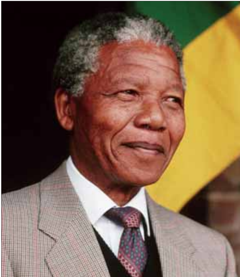
Nelson Mandela - July 18, 1918 - December 5, 2013

"The Last Great Liberator of the 20th Century"