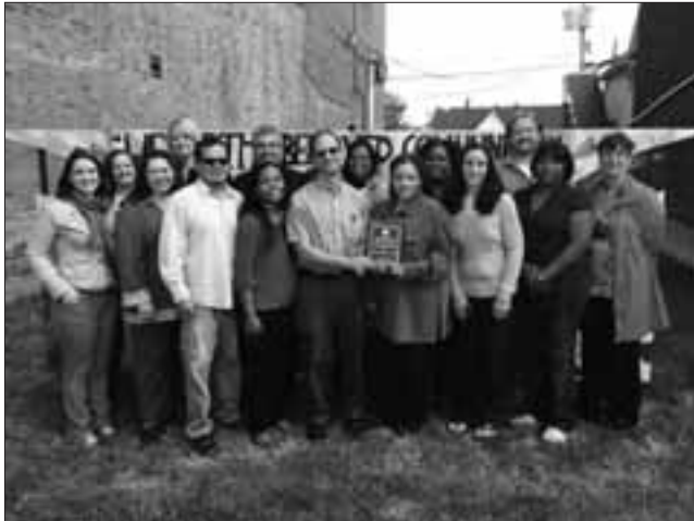
Staff CDC of the Year 10-2013

UN's comprehensive "place-based" strategy and partnerships in Toledo's ONE Village is now considered a model for addressing these challenges.