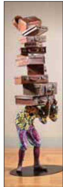
Homeless Child 2 , a life-sized mannequin by Yinka Shonibare