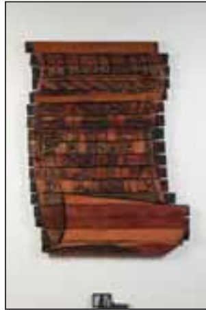
When I Last Wrote to You about Africa by El Anatsui

El Anatsui has been hailed as one of the most significant contemporary African artists. His recent retrospective When I Last Wrote to You about Africa took its name from the wooden, scroll-like wall hanging. The Ghanaian artist, working in Nigeria, is well-known for his bottle cap curtains and had an installation on view earlier this year at the University of Michigan Art Museum and at the Brooklyn Museum.