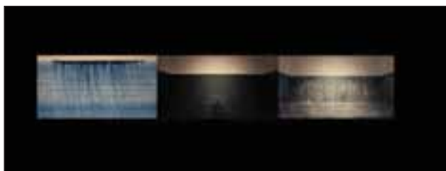
Wall of Sea