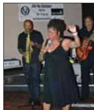
Jazz legend, Ramona Collins