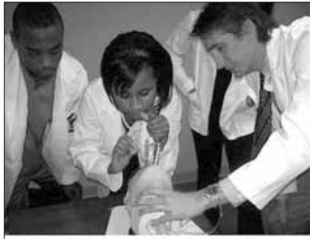
Participants in the Camp Med program learn about nurse anesthesia and numerous other health care careers.

by the UT AHEC program, which along with other programs throughout the