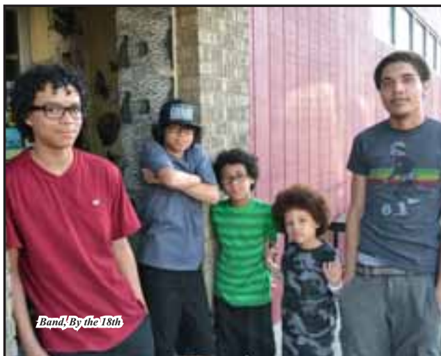
Band 'By the 18th'