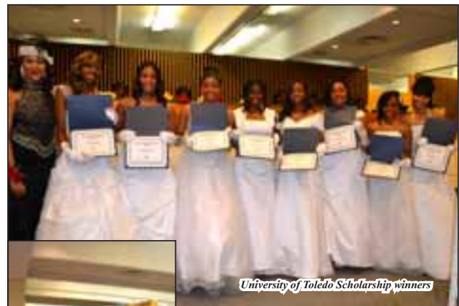
University of Toledo Scholarship winners