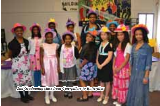
2nd Graduating class from Caterpillars to Butterflies