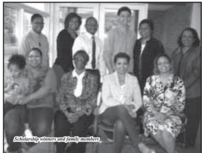
Scholarship winners and family members