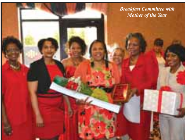
Breakfast Committee with Mother of the Year

Welcome to A&Q Advertising Company. We are a professional marketing firm with years of professional marketing and branding knowledge. Did you know that there are several of advertising companies? What is your business doing that will really set you apart from other companies offering the same products or services? Have you started with the correct way of branding your business? We guarantee professional, quality advertising and branding for your company. We give our customers the precise quote for every marketing strategy you are looking.