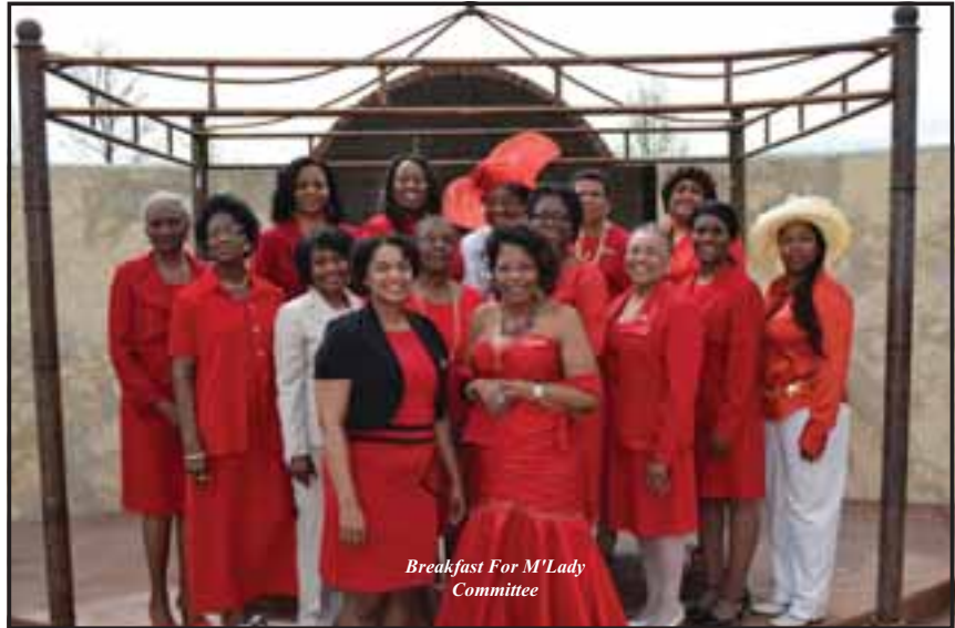
Breakfast For M'Lady Committee