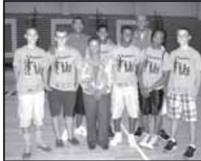
Jefferson Awards, the four winners were selected from 14 finalists.