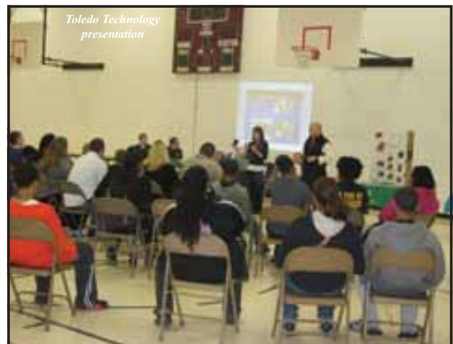
Toledo Technology presentation