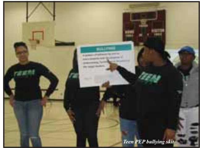
Teen PEP bullying skit

"I want to thank the ladies of Sigma Gamma Rho Sorority, Inc. Iota Theta