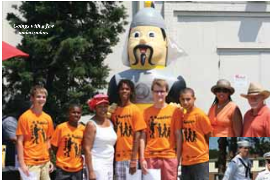
Goings with a few ambassadors