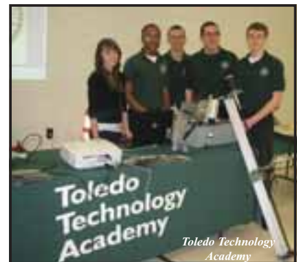
Toledo Technology Academy

"This was a great event, and great turn out. The numbers have increase steadily over the years, which show more community involvement and organization partnerships. I want to thank