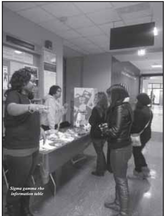
Sigma gamma rho information table

Health and Science campus, every third Monday on the university's main campus and every Tuesday and Thursday at Lucas County Job and Family Services Office on Monroe. The program offers HIV and AIDS testing free of charge, individuals 14 and under need parental consent, call 419-383-3741 for more details.