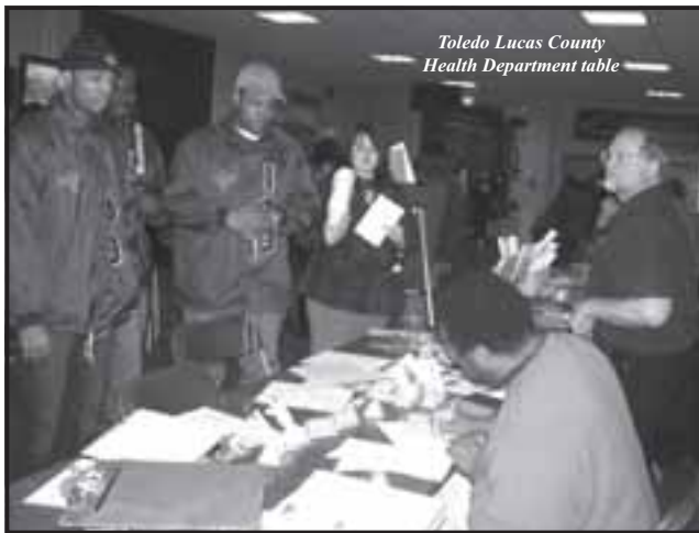
Toledo Lucas County Health Department table