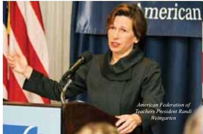
American Federation of Teachers President Randi Weingarten

"All stakeholders - teachers and teacher educators, state education chiefs and education boards, accrediting agencies, and education associations and unions - must help end the patchwork processes we have now. We must work together to ensure that teacher preparation standards, programs and assessments are aligned with a well-