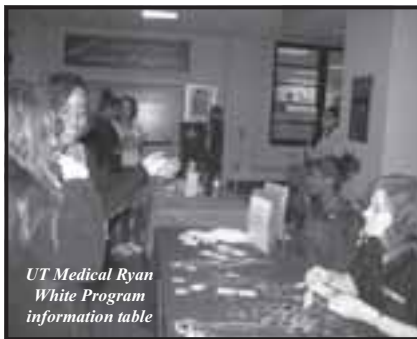
UT Medical Ryan White Program information table

UT Ryan White program provides year-round testing every first Monday on The University of Toledo's