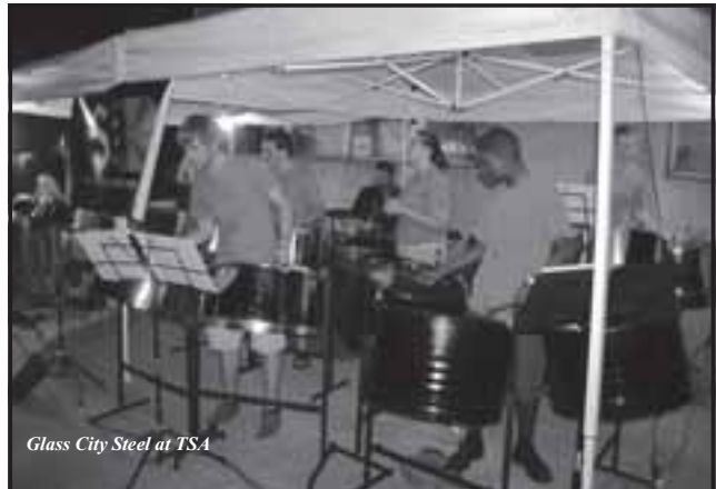
Glass City Steel at TSA