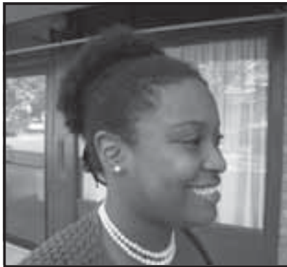
Enchanting Call of the Weave