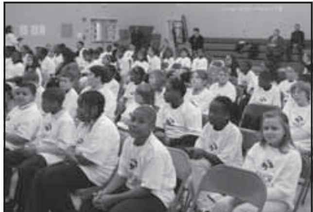
Sherman and Grove Patterson fifth graders

and coach in the fifth grade. In the sixth grade campus visits will begin along with the identification of career