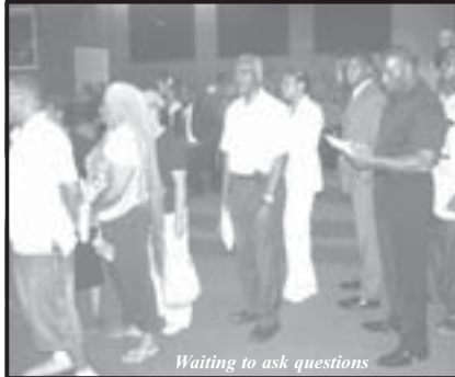
Waiting to ask questions

The five candidates are headed towards a September 15 primary which will narrow the field down to the two top vote-getters. The top two will then go head to head in the November 3 general election.