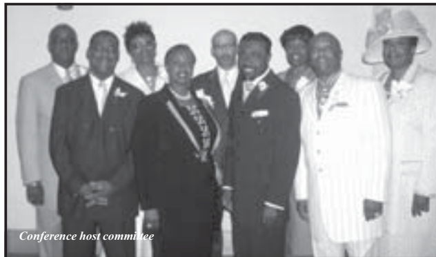
Conference host committee

The week-long conference kicked off with a musical at Indiana Avenue Missionary Baptist Church then